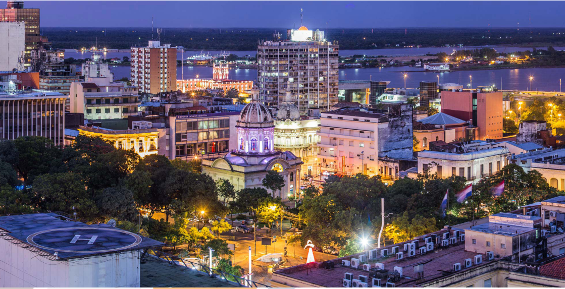
Asunción's historical downtown