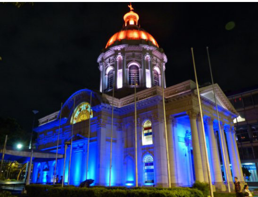
Pantheon of the Heroes

Asunción, capital of Paraguay and known as the Green Capital of Ibero-America due to its rich and abundant greenery, is a dynamic and growing city that combines nature, historical colonial-style architecture and infrastructure. Being at the heart of South America, the city offers easy access from every part of the world and has already been host to many other important international events. Comfortable accommodation in national and international hotel chains is available, as well as many modern conference facilities.