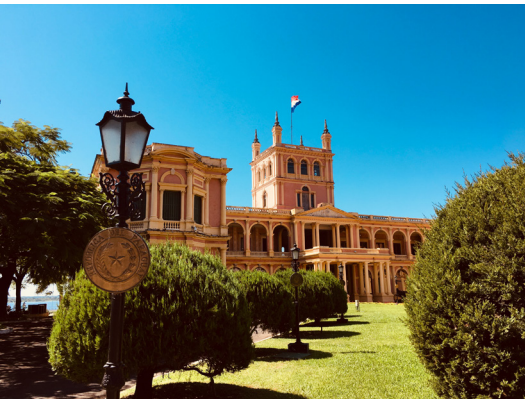
López Palace. Government house