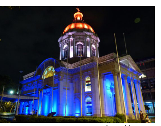
Pantheon of the Heroes