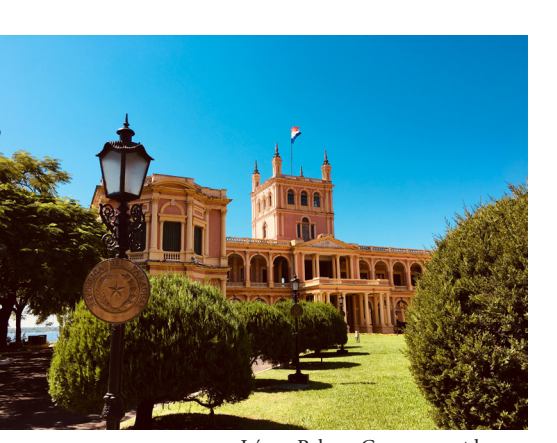
López Palace. Government house